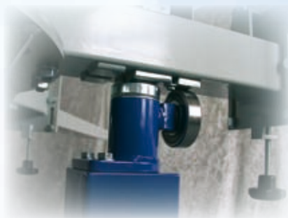
Pallet arm support