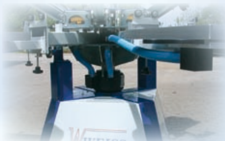
The vacuum system